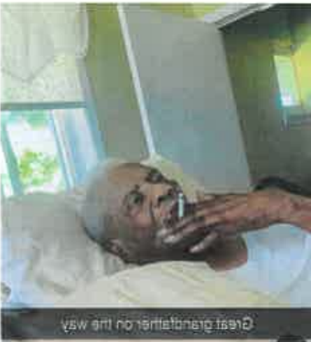
Great grandfather on the way