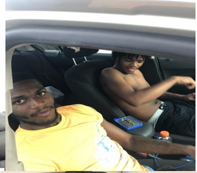
It's alot going on utw 🍷